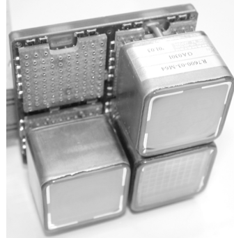
(b) Front-view of the prototype EC, with three of the MAPMT installed.

apparatus has to be compatible with the requirements imposed by a Space mission including: mechanical robustness and compactness, resistance to environmental factors (including radiation, chemical contamination and thermal excursions), high reliability and low ageing.