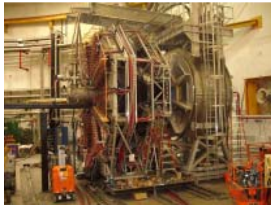
Fig. 1. Photograph of the the G^0 set-up installed in Hall C in its “backangle” mode.

Part of a worldwide program, the G^0 experiment is carried out in Hall C of Jefferson Laboratory by a large collaboration of scientists from institutions in the United States, Canada, France, Armenia and Croatia. The ultimate goal of G^0 is to provide data to allow a comprehensive and precise map of the neutral weak form factors of the proton over the range of momentum transfers 0.1-1.0 (\text{GeV}/c)^2 . This is done by measuring PV asymmetries in the scattering of polarized electrons on hydrogen and deuterium targets. To allow a separation of the different contributions (electric, magnetic, axial), the G^0 experimental program is now performing its backward angle measurements. In the coming months, it will provide results for two Q^2 values, 0.23 and 0.62 (\text{GeV}/c)^2 . During these measurements, with