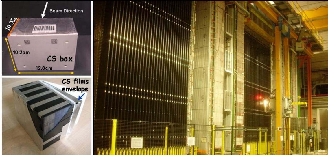
Figure 1. On the left are shown two pictures of OPERA target bricks, a complete brick (top) and an exploded view of a brick (bottom) showing its structure and the CS films packaging. On the right, a picture of the OPERA detector shows the two target sections (black covers) and their spectrometers. One of the brick manipulators is seen operating along the second target block.