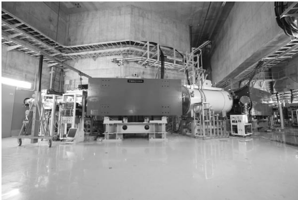
Fig. 1. Newly constructed beam line magnets: two normal-conducting dipole magnets (DH7 and DH8) and a superconducting triplet quadrupole magnet(STQ-H15).

The construction of the spectrometer and the beam line was continued until the end of February 2009. Cathode read-out drift chambers (CRDC) were installed at the focal plane of the SHARAQ spectrometer in January 2009. The vacuum chambers and pumping systems of the spectrometer were built in February.