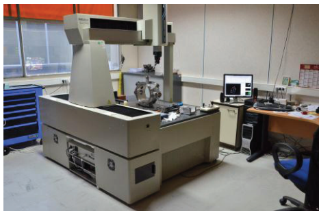
Figure 2: Picture of Mitutoyo 3D machine (precision and resolution of 5/1\mu\text{m} ) used for dimensional testing, with the chamber body and special BPM positioning tool at the edge.

Dimensional checks (see Figure 2) were performed to establish space coordinates for the main mechanical references. In addition, the internal positioning system is being measured as part of pre-alignment, by placing shims to absorb residual errors from machining. As part of this process, a special BPM positioning tool was made.