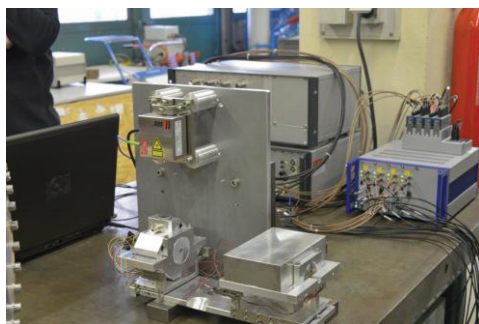
Figure 3: Calibration and stability studies of mechanical assembly with piezo-movers supporting the third IP-BPM.

An interferometer from Sios (see Figure 3) is used to qualify the performance of the piezo-movers and of the entire mechanical assembly, in particular the closed and open loop stability, the setting accuracy and reproducibility and the calibrations provided by the manufacturers.