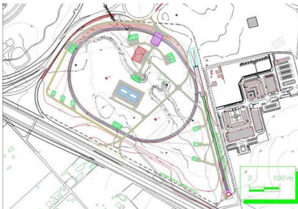
Figure 1: SuperB rings in the Tor Vergata University site.

The SuperB collider has been approved by the Italian Research Minister as part of the Italian National Research Plan, with a 5 years construction budget. The next steps will be the formation of an international consortium in charge of the construction and operation of the collider, detector and SR beam lines.