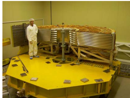
Figure 4. EM End-cap ECC wheel assembly (April 2003)

The End-cap cryostat is ready and 10 out of 16 End-cap modules are being assembled at CERN. ECC integration is planned for fall 2003 and ECA integration will take place in summer 2004 (figure 4). Electrical tests of 36 EM End-cap presampler modules have been finished November 2002.