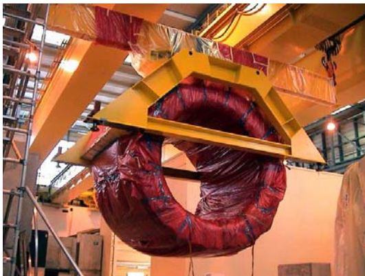
Figure 3. EM Barrel M wheel transfer to cryostat (February 2003)

The final assembly phase is well under way. The EM Barrel has its first wheel of 16 modules inside the cryostat and is electrically tested (figure 3). The tests on the inserted wheel have shown that the readout channels satisfy the qualification criteria. All modules of the second wheel