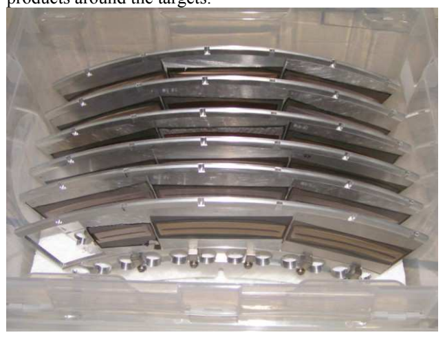
Figure 4: 208 Pb targets on segments of the wheel after irradiation.

A first test irradiation with a ^{58}Fe beam on ^{208}Pb took place in order to produce isotopes of hassium (Z=108) and reproduce the known the excitation function from the GSI [4]. ^{208}Pb targets rotating at 1500 rpm were then irradiated for nearly three weeks with a ^{76}Ge^{10^+} beam of 5 MeV/u at 0.8 \mu Ap (average). The power dissipated in the targets was 6 W. The integrated beam was 5*10^{18} particles. Meanwhile, we replaced the targets every five days. The target quality and the synchronization between the beam pulses and the wheel rotation were continuously monitored with a silicon surface barrier detector measuring scattered particles and a BaF_2 crystal detecting the \gamma -rays of the reaction products around the targets.