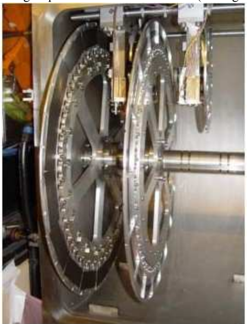
Figure 1: Target chamber with the two wheels bearing 18 Pb or Bi targets and 18 carbon charge equilibration films.

To help with the heat dissipation problem, the target material is deposited onto mechanically strong heat conducting layers of 35 \mu g/cm^2 of carbon. A thin protective layer of about 5 \mu g/cm^2 of sublimed carbon covers the target surface in the downstream direction to reduce sputtering loss. So for the abovementioned experiments, two wheels, with a diameter of 670 mm, bearing either 36 short or 18 long targets were mounted on a common axis to rotate together at 2000 rpm. Targets are mounted on the upstream wheel and carbon foils for charge equilibration on the other one (see Figure 1).