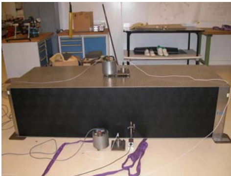
Figure 1: Experimental set-up

TMC Company has measured characteristics of the first resonant frequency of the table in free configuration [1]. The Guaranteed Minimum Resonant Frequency is at 230Hz with a Guaranteed Maximum factor Q of amplification at resonant frequency of 1.5. A quick and easy test has been done by putting the table on four rigid supports at the corners in order to measure its first eigenfrequency with lead masses of 1400Kg (weight of final doublets) and without. The experimental set-up is shown in figure 1. Guralp CMG-40T velocity sensors and ENDEVCO sensors [5] were used to measure vibrations from 0.1Hz to 40Hz and from