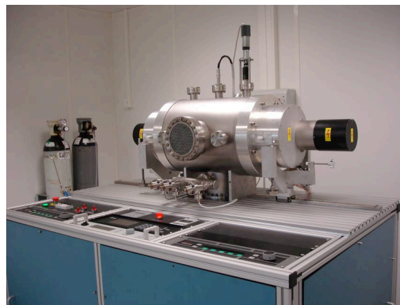
Figure 1: Magnetron sputtering system overview.

The technology chosen for TiN coating of RF ceramic windows is the reactive DC magnetron sputtering. For this purpose, a sputtering bench has been developed with the collaboration of the consortium Ferrara Ricerche-Italie in the frame of CARE program.