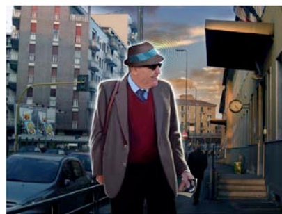
Figure 2. Exemplary images of potential applications of CURVACE as sensors integrated in flying microrobots for vision-based navigation (left) and vision-based collision-alert system for visually impaired people (right).