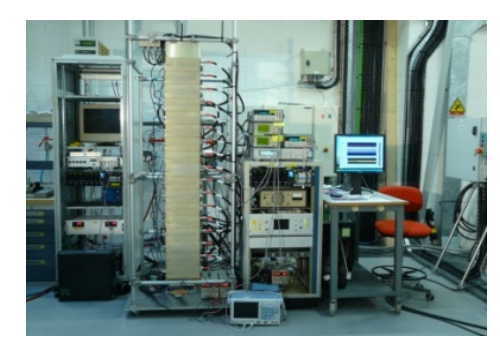
Figure 2: 500 MHz 10 kW unit prototype under long-term test at SOLEIL.

CW SSA is being built and will be tested on a dummy load, by the end of 2014 at SOLEIL.